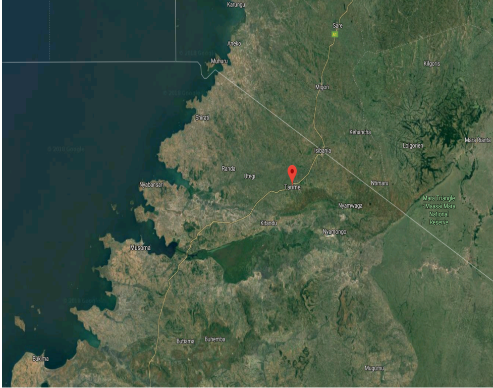
Figure 1: Google Map of Tarime, Mara Region.

interviewed in the FGDs. The quantitative survey questionnaire asked respondents about their socioeconomic demographics; political participation; promises made by their MP in the last 2015 elections; their evaluations of their MP's quality both in isolation but also in comparison to other MPs; the extent to which they are altruistic individuals; and finally, expectations and experience of the Mbunge Live Show.