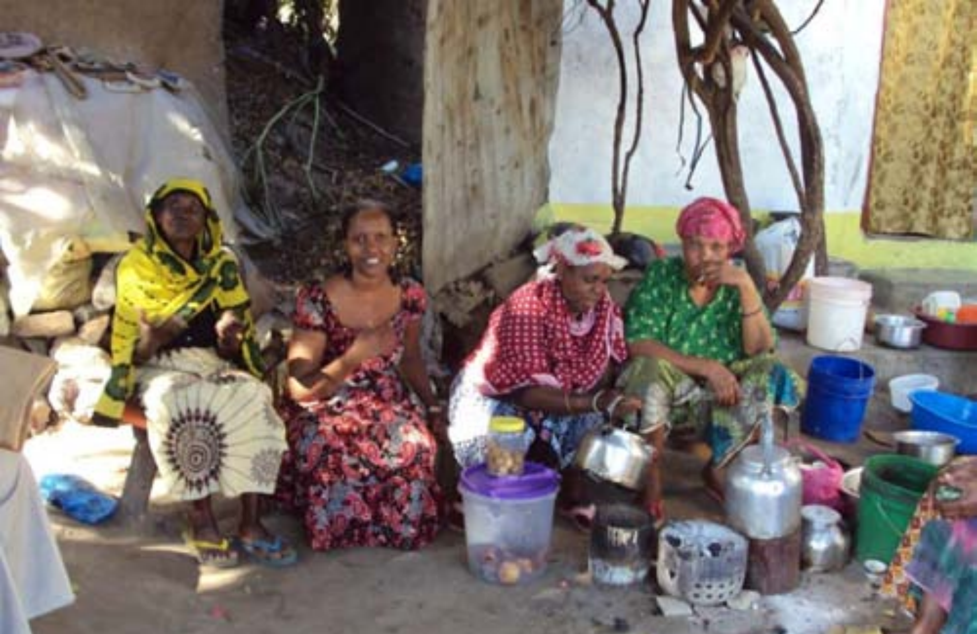
3. Booming food business in urban Mwanza